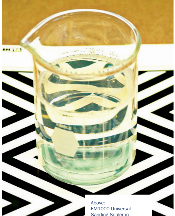
Above: EM1000 Universal Sanding Sealer in glass beaker to illustrate the clarity of this unique formula.

Use only in well ventilated areas. Avoid inhaling spray mist. Wear a NIOSH/MSHA approved respirator during spray applications.